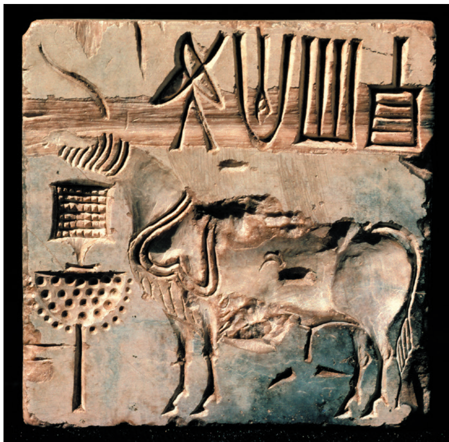
The mysterious Indus unicorn on a roughly 4,000-year-old sealstone, found at the Mohenjo-daro site.