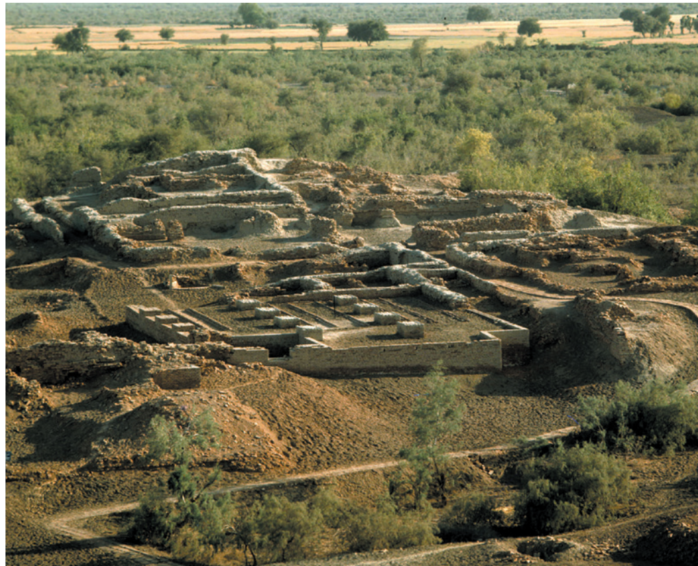
Mohenjo-daro existed at the same time as the civilizations of ancient Egypt, Mesopotamia and Crete.

"No firm information is available about its underlying language."