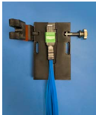
MPO/MTP® Adaptor Mount

MAN : = Add to part number for manual type V-Groove measurement system