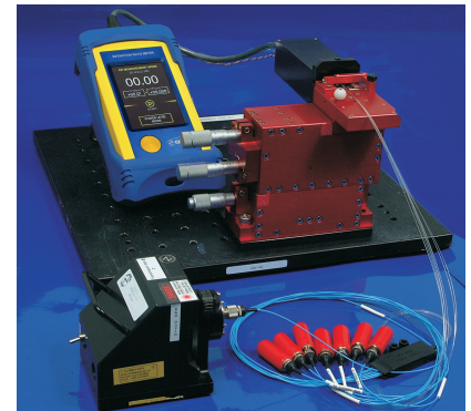
ER-Measurement Test System for V-Groove (Manual Type)